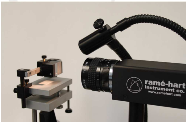
Overhead Optical Imaging Kit Model 100-31

Kit includes an Illuminator Fixture, Overhead Reflector Fixture, Upgrade from DROPimage Advanced v2.x to 2.6**, User Guide, and all tools and parts.